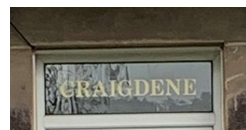
House Name - Craigdene - Daniel Craig

5. Find the surname of a James Bond actor. Cross out the first letter of the name.