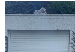
Lion on roof of no. 9 ( 9 + 9 - 2 = 16 )

3. The king of the beasts chooses to rest at this number. Now double it and take away 2. Cross out your answer.