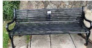
Bench - 18 rungs

2. A place to rest. Count the bars and cross off the number you reach. And now cross out all the letters in that column.