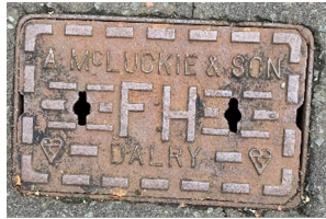
Drain cover - A. McLuckie & Son

1. Find a person of fortune. Cross out the 3 rd letter of their surname.