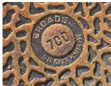
Drain cover - Broads Silent Knight

4. Cross out the silent letter in the Christmas Carol.